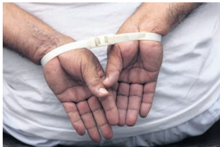
A handcuffed man, arrested for alleged gang connections, waits to be transferred to a prison at the police delegation of San Bartolo in Soyapango, El Salvador, Aug. 16, 2022.

Under the decree, the right of association, the right to be informed of the reason for an arrest and access to a lawyer are suspended. The government also can intervene in the calls and mail of anyone they consider a suspect. The time someone can be held without charges is extended from three days to 15 days. □